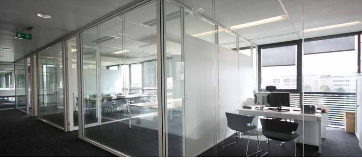
SOME OF OUR REFERENCES